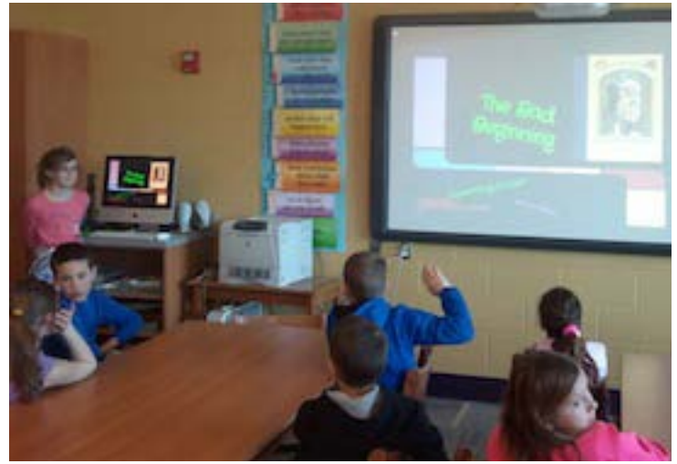
BCIG Fourth grade students learned about Googledoc presentations and citing their sources. Each student created a book report presentation and showed it to their class. After presenting, they answered their classmates' questions.